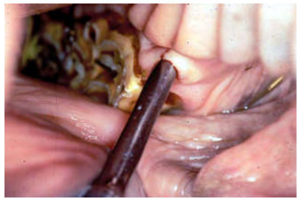
A Burgess elevator being used to remove a wolf tooth