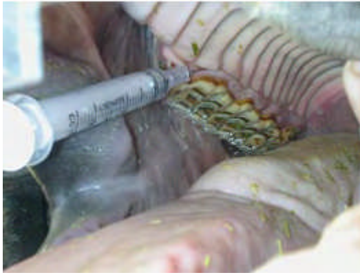
Local anaesthetic being injected into the gingival tissue surrounding the wolf tooth