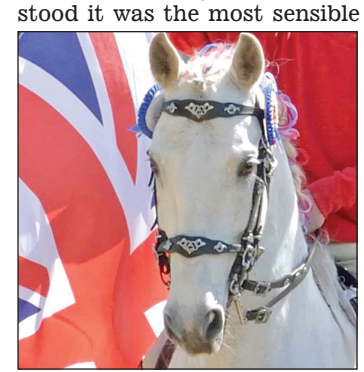
Tetua performing in a demonstration

He continued: "I was shocked and devastated, but under-